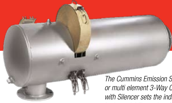
The Cummins Emission Solutions single or multi element 3-Way Catalyst XLS with Silencer sets the industry standard in dependability and performance.

These superior designs yield the lowest achievable pressure drop without sacrificing acoustical performance, giving you